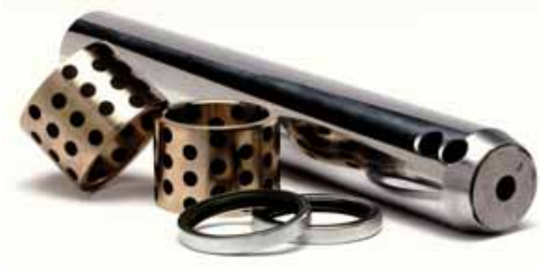
EMS chrome plated pins with brass bushing

Low maintenance Extended Maintenance Bushings (EMS) provide 1,000 hour/six month greasing intervals, greatly reducing daily and weekly maintenance for the operator. The bucket pins retain a 250 hour greasing interval. Fitted as standard, anti-friction shims in the boom foot and head reduce noise and cut free play.